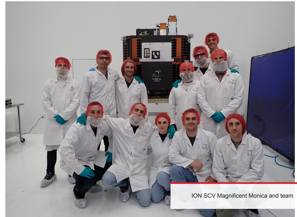
ION SCV Magnificent Monica and team

The name of the satellite carrier is “ION Magnificent Monica”, a combination of the acronym “ION”, which stands for “InOrbit NOW”, and the satellite’s first name. This format follows the naming conventions of naval vessels used in navies around the World. The name “Monica” was drawn at random from a bowl containing the names of all D-Orbit’s employees. The company will continue to follow this procedure in the future to honor the skills, energy, passion, and commitment to its people.